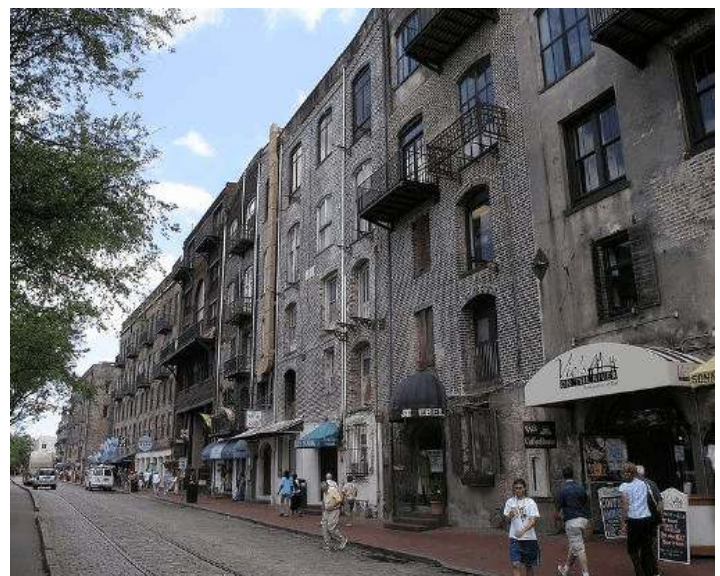
River Street, Savannah, Ga.